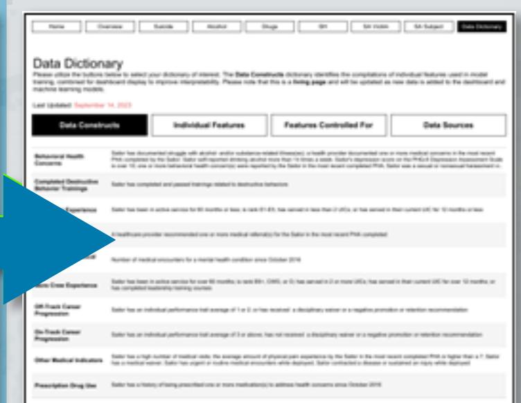
04 | DATA DICTIONARY TABS Review data and model feature information by clicking the tabs labeled Data Constructs, Individual Features, Features Controlled For, and Data Sources.