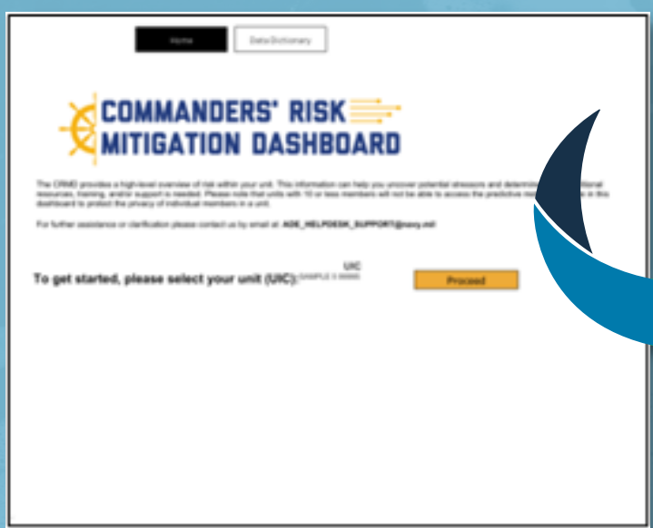
01 | HOME PAGE Select UIC and click Proceed button.